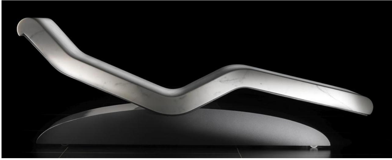
Discover the world's most elegant expression of "thermotherapy". Natural Infrared Energy embodied in an artisan, marble sculpture.

The graceful design of the "Classico" model is repeated in our "Moderno" model. The simplified, low profile design and elegant curves of the base will fit perfectly in any surrounding. Unlike the model Classico, Moderno is not available in the reclining position. It is therefore suitable in situations where "relaxation" is the primary focus of treatment.