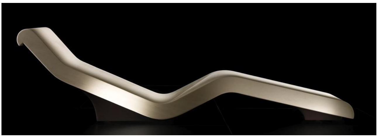
Discover the world's most elegant expression of "thermotherapy". Natural Infrared Energy embodied in an artisan, marble sculpture.

Minimalistic, contemporary design embodied in the same exquisite sculpture found in Cleopatra and Diva, this is the appeal of the "Basico" model. Basico is the choice for purists who understand that essentials are sometimes enough to enhance and reflect the aesthetics of a peaceful sanctuary. An optional wooden base underlines its purist elegance making it the perfect choice to enrich pool or Spa surroundings.